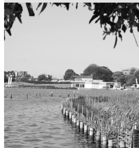
Parks & Open Spaces