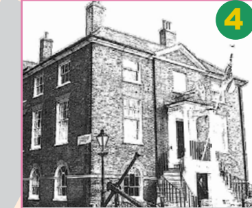
4 Custom House