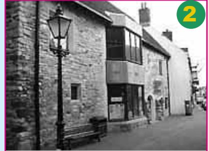
2 Scaplen's Court