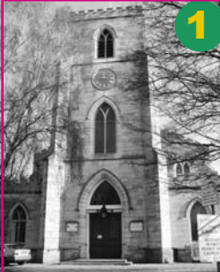
1 St James' Church