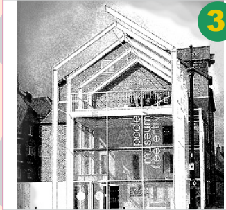
3 Poole Museum