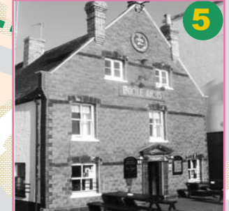
5 Poole Arms